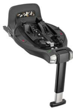
Darwin 360° i-Size car base for Darwin Infant, Darwin Infant Recline and Darwin Next Stage i-Size (ECE R129/03)