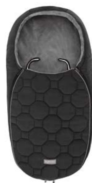
Newborn Winter Footmuff for carrycot and car seats