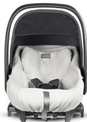
Summer Cover for Darwin Infant Recline car seat