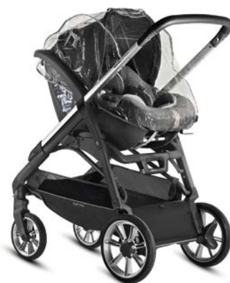
Mosquito net for Infant car seat